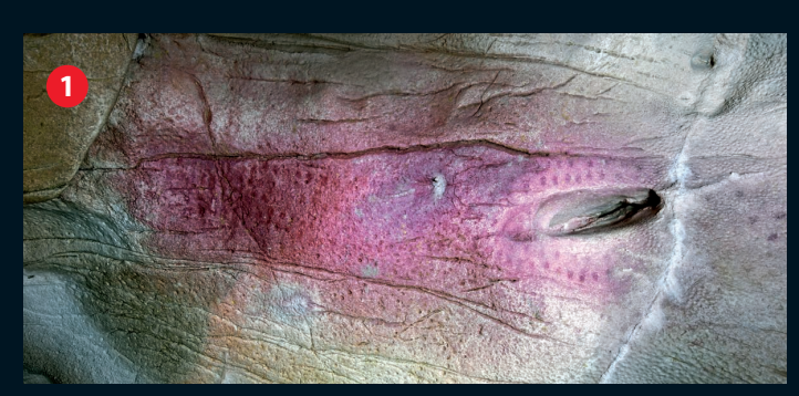
It is necessary to crawl inside the cave. The guide will provide hairnets and kneepads.

The name of the cave comes from the Moor Chufin who, according to local tales, hid treasure inside the cave. But the real treasure is the group of Palaeolithic drawings and paintings in the cave, particularly the engravings in the entrance, within daylight, next to a prehistoric dwelling. Nearly all the figures in this area represent hinds, many of them depicted with three deep lines. It is a clear example of an exterior group, dated to between 25,000 and 18,000 years ago. It is surprising to see a lake inside the cave, but this is a consequence of the Palombera reservoir flooding the valley. Several red paintings are seen around the lake. Most of these are signs, mainly rows of dots, rather than animal figures, although an aurochs, two horses and a stag can be seen, as well as a possible female figure. These are all at least 20,000-25,000 vears old.