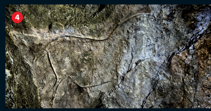
To visit the cave it is necessary to book at least a day in advance. Visits are subject to availability. Hairnets must be worn during the visit and they will be provided by the guide.

The cave is 100 metres long, but its interior chambers and passages are small and quite difficult in some places. The predominant techniques in the cave art are incised and finger engraving. The walls were decorated in an early phase at least 22,000 years ago, while most of the engravings inside the cave are more recent, about 15,500-13,000 years old. The entrance contains some very old Palaeolithic engravings, associated with the occupation levels, particularly the figure of a horse. Inside the cave, the most abundant figures are horses and bison, followed by aurochs, ibex and stags. In the furthest and most remote part of the cave is one of the few human representations in northern Spain, very similar to some engraved anthropomorphs on the ceiling in A