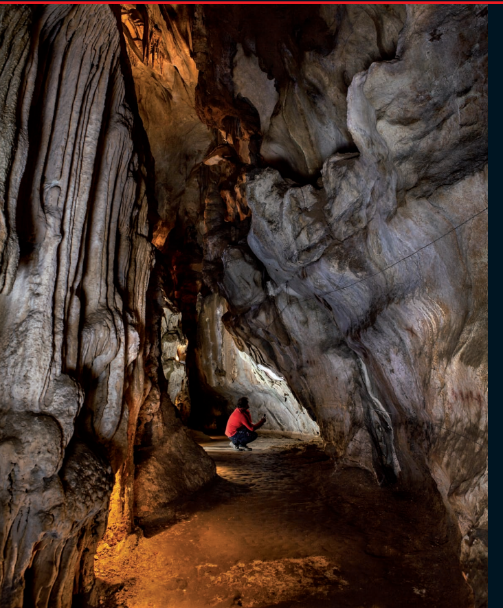
El Castillo Cave, Gallery of the Discs (Puente Viesgo)