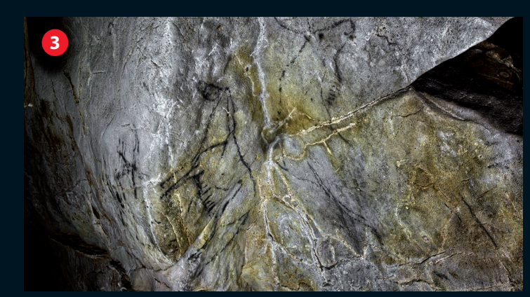
In summer and Easter, activities connected with prehistory are held for people of all ages. Tickets for both caves can be obtained at the entrance of El Castillo.

The cave was given its name after 20 coins from the time of the Catholic Monarchs were found there, connecting the cave with legends of treasures. It is 350 metres long, and the first 250 metres are visited. In addition to the prehistoric art, the cave is famous for the beauty of its geology, with large chambers in the first 200 metres containing colourful flowstone, columns, stalactites and stalagmites. The pictures were drawn with charcoal in a small passage near the entrance. The animals represented are characteristic of a cold climate, such as reindeer, which are very unusual figures in Palaeolithic art in northern Spain, horses, ibex and a bison. They have been dated to 12,300 – 11,500 years ago. No occupation levels contemporary with the paintings have been found, and the nearest levels of that age are in El Castillo Cave, 650 metres away.