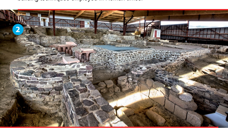
Visits to the Domus Ivliobriga and the archaeological site of Camesa/Rebolledo are guided and last about 45 minutes. If both Roman sites are visited in the same day, the price of the visit to the second site is reduced

This luxurious Roman villa, with its baths, was built in the first century AD in the proximity of a town. Its large storage area gives an indication of the rural activity carried out there. The villa was abandoned in the middle of the third century AD and the land was used for a cemetery in the early Middle Ages. This is shown by the numerous pit and stone-lined graves, and a smaller number of sarcophagi, located around the foundations of a church of the same age. This consisted of a single nave and a rectangular apse. The history and distribution of the Roman villa is explained during the visit, highlighting the purpose and use of the different parts of the baths and the building techniques employed in Roman times.