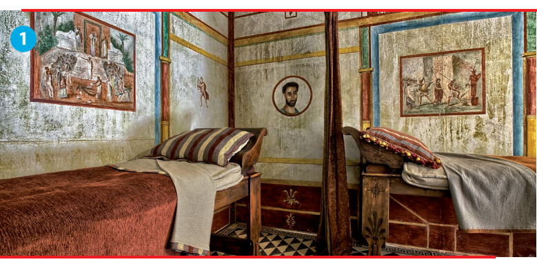
Educational workshops are held for school groups. Visits to the Roman town are free of charge.

The DOMVS of IVLIOBRIGA is situated in the Roman town of the same name. It recreates in its design, size and distribution the so-called House of the Firedogs, with its Hellenistic ground plan and located only 200m away. This house was built in the late first century AD, the time of the town's greatest splendour. The DOMVS reproduces the main room, the triclinimum, visible from the entrance to the house. It was used for meetings. banquets and as an office. The interior courtyard with its columns is surrounded by the lararium, for offerings to the gods; the cuina, where succulent meals were cooked; the cubiculum, a place to rest and where the family could be together; and the tavern, for the financial support of the family. On the second floor, the permanent exhibition displays the main archaeological finds in the town, connected with the daily life of its inhabitants. The history and urban layout of the town are explained during the